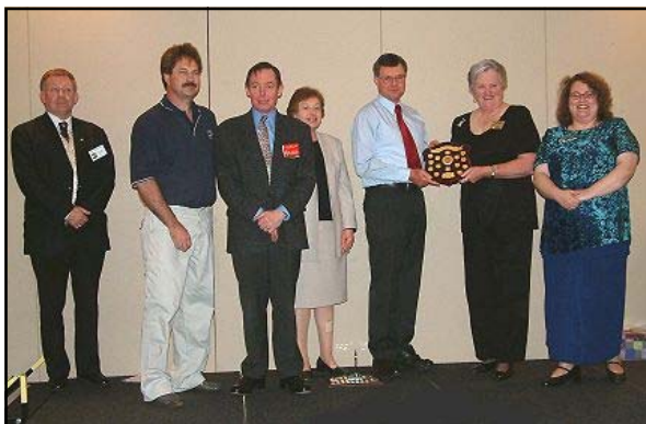
Monaro Division Club of the Year Award